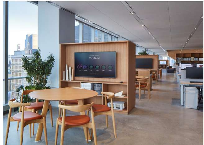
WELL Dashboards Share IAQ Data

science-based healthy building parameters. SOM is attempting to earn WELL points for displaying air quality data for building occupants, using Aircuity's API to pull points into their specially designed WELL dashboards displayed in their lobby. Designed to meet a variety of clients' needs, Aircuity's API connection can be used to view healthy building data with "out of the box" analytics or can be used to bring Aircuity points into a client's existing dashboard as in SOM's use case. This provides a concise view of current building conditions and preserves bandwidth by using one connection versus many.