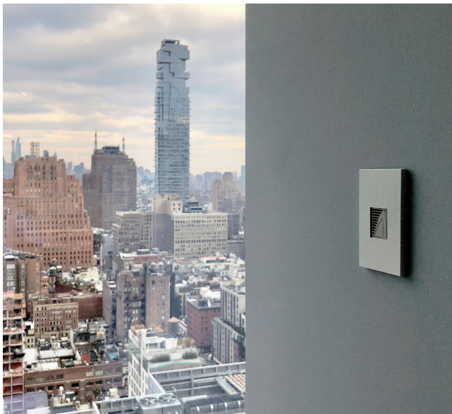
SOM Headquarters ▪ 7 World Trade Center

HEADQUARTERED ON THE 27TH AND 28TH FLOOR of 7 World Trade Center in New York City, Skidmore Owings & Merrill (SOM) is a leading design firm consisting of architects, designers, engineers and planners. The firm was designing their new headquarters with a focus on the environment along with prioritizing the health and safety of employees. To address employees' well-being, SOM is pursuing IWBI's WELL Certification and selected Aircuity to earn required points in one of WELL's largest categories, the Air Concept. This enables the firm to optimize ventilation and provide a healthy, productive environment for occupants while also reducing their carbon emissions.